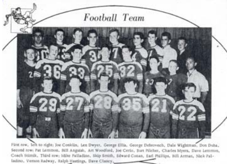
1954 Fabius High Football Team.

Since 1954, football has been absent from the Fabius-Pompey communities. It is our goal to see that football makes its return after a fifty-year absence.